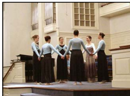
Interpretative Ensemble of Bon Air Baptist Church